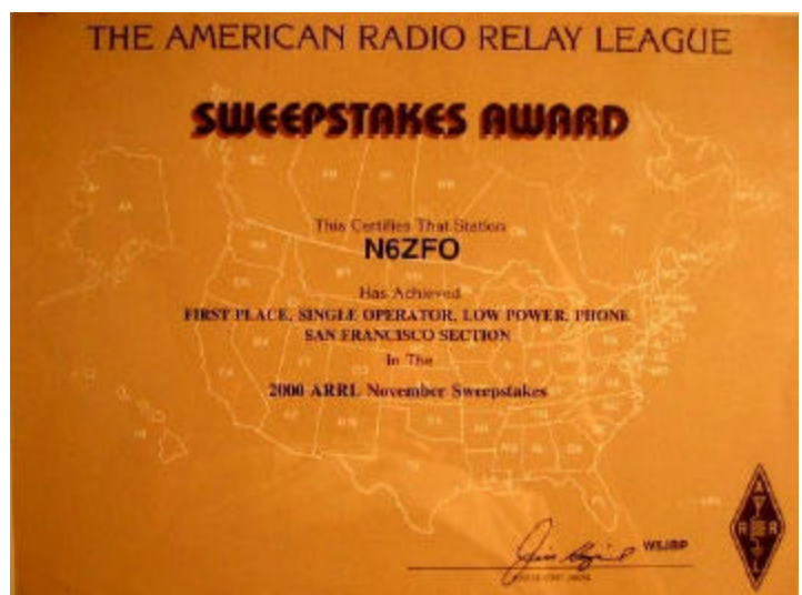
Figure 1a. Old Style ARRL Contest Certificate.

Fortunately, funds were available to develop the novel glasses based on the savings realized from eliminating contest line scores from QST.