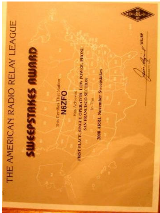
Figure 1b. New VF Style ARRL Contest Certificate.