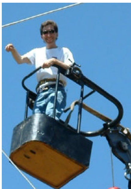
K2KW in the bucket...is that a hand signal he’s giving?