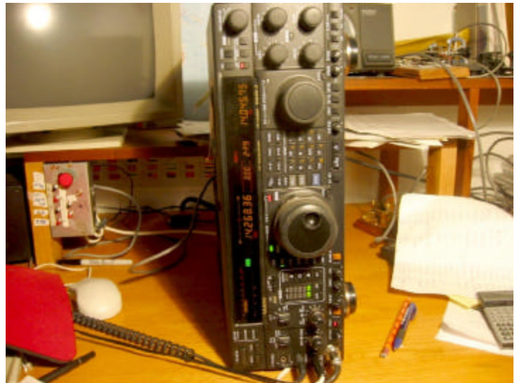
Figure 2. VF Style Transceiver Inspired by ARRL Vertical Contest Certificate Format.

since these new VF rigs overturn years of work to place the FT-1000's essential knobs in the least convenient position. For example, right-handed purchasers of FT1000 MP MkV LL rigs will be able to more conveniently reach, and actually see, the RF power and keyer controls. One group in the company seeks a complete redesign to place these essential controls in the center, recessed into a well and almost impossible to adjust except with tweezers. A second faction feels that the neck strain issues will provide the desired level of discomfort and inconvenience.