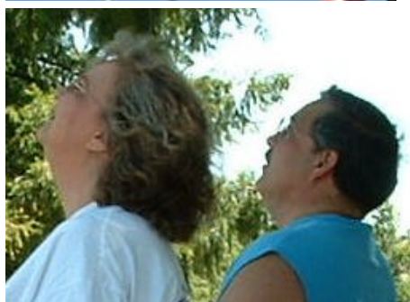
NA6E and WT6P watching K2KW in the bucket. I’m sorry Kenny, I just don’t understand the hand signal....