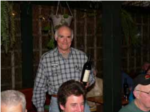
Like Ed, W0YK, really needs a bottle of wine! But, he'll take it.