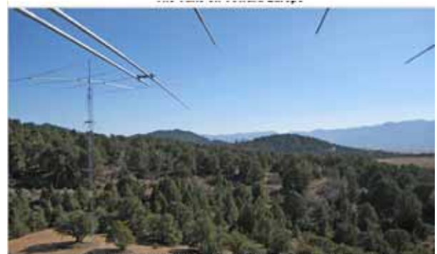
The Take-off Toward VKZL (Photos from atop 80' Tower #2)