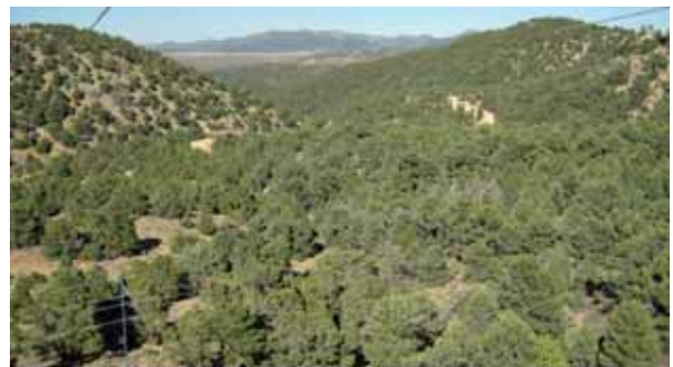
The Take-off Toward East Coast USA