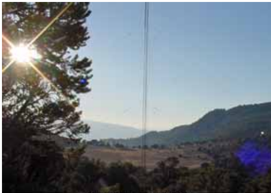
160 Vertical up to 75' (8-12-07)