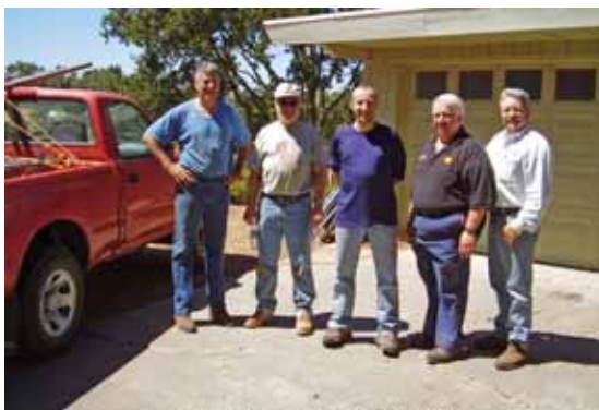
The NCCC Loading Crew in Danville (L to R) W6NV, N6RO, KX7M, K5RC, W5FU