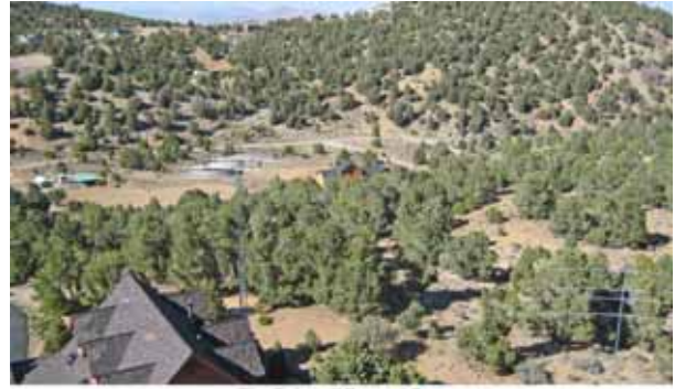
The Take-off Toward Europe

W5FU (NA5R) and I are planning one last big contest station to be ready for the next solar maximum. Phase 1, for 2007, includes adding towers #7 and #8 to the existing K5RC station. One is a full size vertical for top band and the other is a rotating tower with stacked 6 over 6 on 20 and 2 over 2 on 40. We will also add at least two wire yagis for 80. Our web site will be updated every few weeks as we make progress. Please check back as the great erection of 2007 progresses - http://consultpr.com:80/2007.htm .