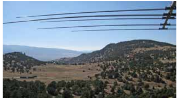
The Take-off Toward Japan