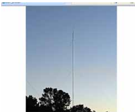
160 Meter Vertical Completed Total height = 115' with stinger