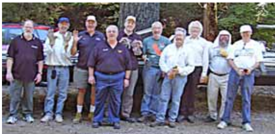
The NCCC Loading Crew in Los Gatos (L to R) WX5S, W6OAT, KA6W, K5RC, K2RD, K6TD, W5FU, K9YC, W6ZZZ, K6EU