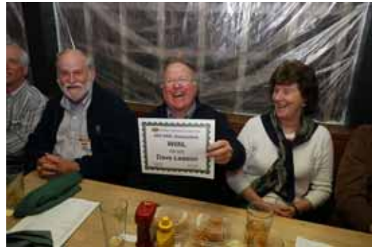
N6XI, K6GT, W6NL, K6BL