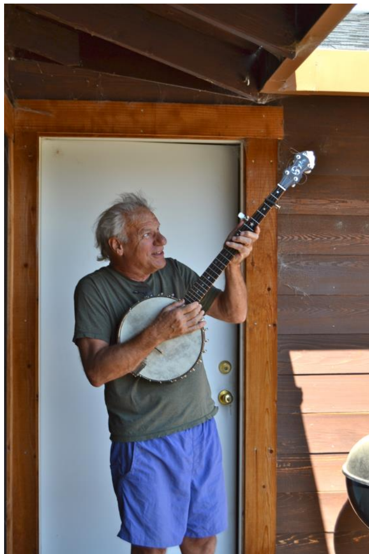
K6SRZ does the CQP 15-minute break(down) with apologies to Earl Scruggs