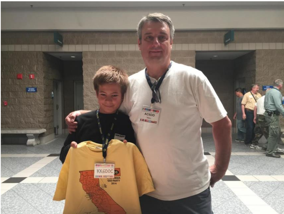
Father & Son team