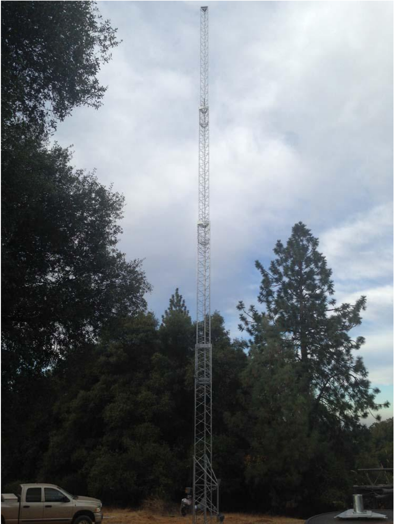
K6SCA's New Tower