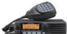
TM-281A 2 Mtr Mobile