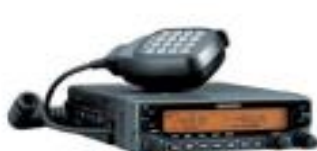
TM-V71A 2M/440 DualBand