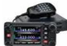
FTM-400XD 2M/440 Mobile