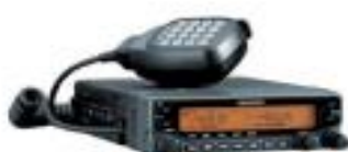
TM-V71A 2M/440 DualBand