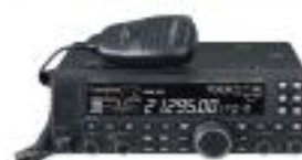
FT-450D A100W HF + 6M Transceiver