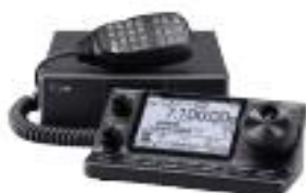
IC-7100 All Mode Transceiver