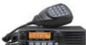
TM-281A 2 Mtr Mobile