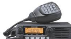
TM-281A 2 Mtr Mobile