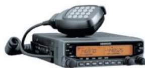
TM-V71A 2M/440 DualBand