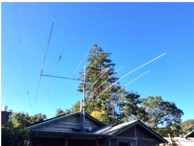
The N6TVN Antenna Farm in Sonoma, CA.