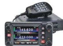
FTM-400XD 2M/440 Mobile