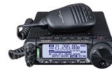
FT-891 HF+50 MHz All Mode Transceiver