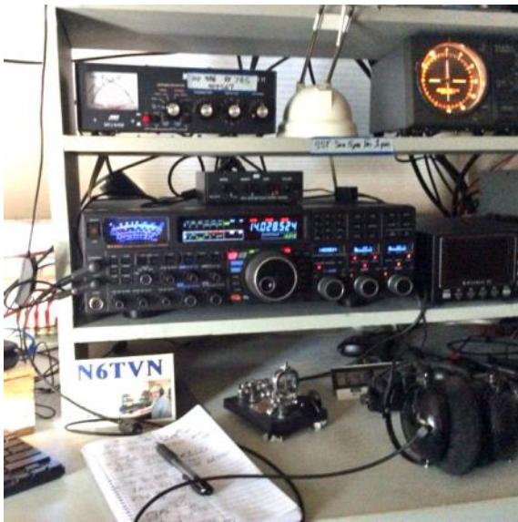
The N6TVN Shack. . FTDX5000MP, a K3/P3, and a K2 plus accessories.