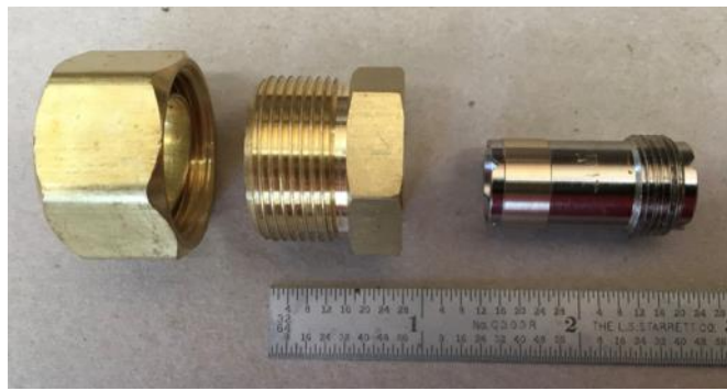
The parts, ready for soldering

A torch is required for soldering. Be sure that the parts are squeaky-clean. Fine steel wool works great to remove any oxidation. Apply flux to the parts before slipping them together. I use the paste flux sold for soldering copper pipe; it washes off with water. Balance the parts on the end of a steel rod or maybe a large socket to keep the end of the connector flush with the end of the bore in the fitting. Wrap a piece of 1/16" solder around the joint and heat from the bottom. It'll flow into the joint real nice. Don't overheat. When cool, scrub everything off with water and alcohol.