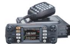
FTM-300DR C4FM/FM 144/430 MHz Dual Band