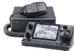
IC-7100 All Mode Transceiver