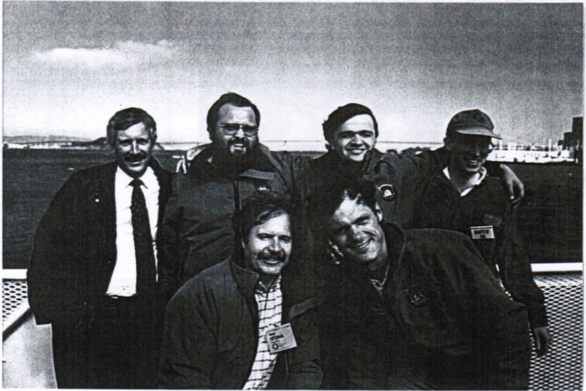
Multinational DXers enjoy a Bay cruise following the Goodwill Games. From left: W6OAT, HA0MM, YU1RL, N6TV, YT3AA, HA6NY.