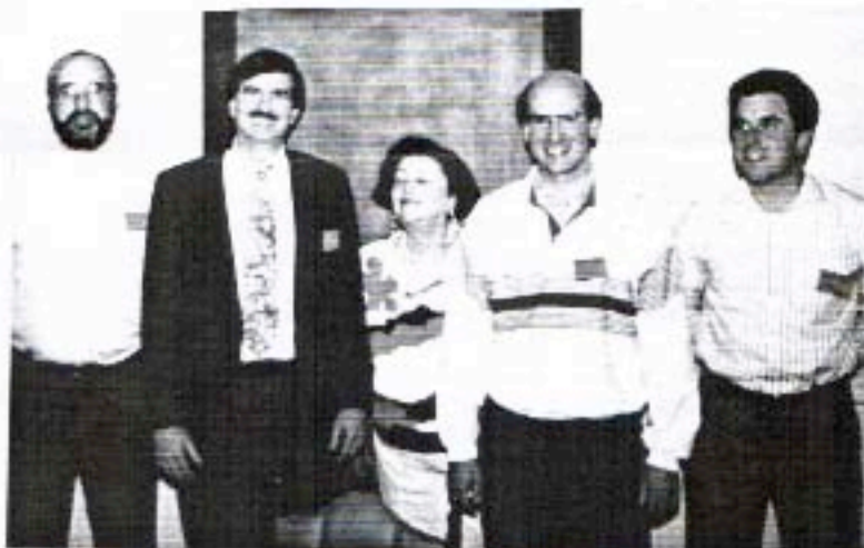
ABOVE: NEW BOD RARIN' TO GO KJ6LD, AE6Y, KA6ING, N6TV, N6IP. NOT PRESENT, WN4KKN, WA6SDM