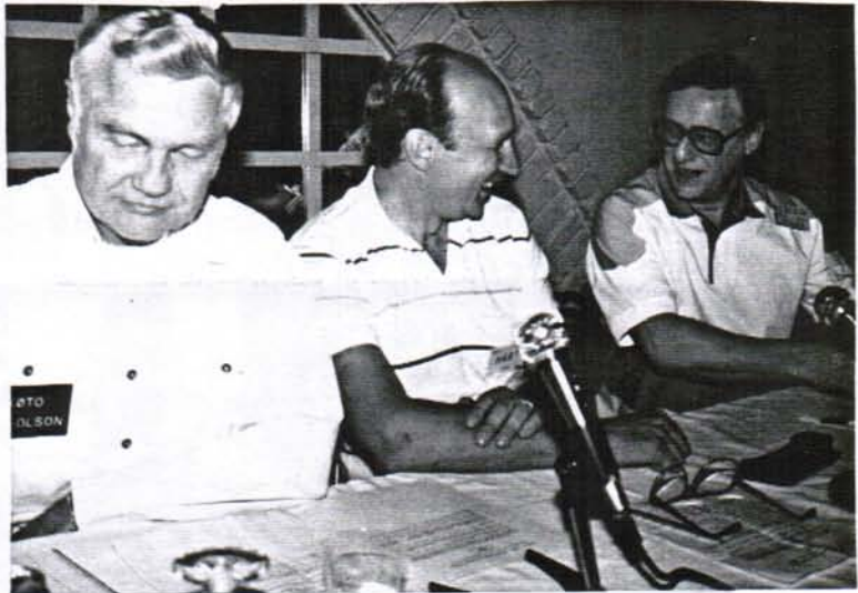
THE CONTEST FORUM WAS HIGHLY ENJOYED BY PARTICIPANTS N0TO, N6BT, AND G3SXW