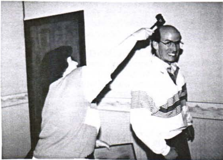
KA6ING CROWNS THE NEW PRESIDENT N6TV