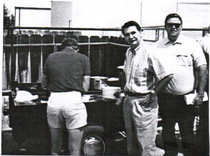
W6RJ AND WA7NIN CHECK OUT THE BAR-B-CUED BEEF

There are many more rules than these, but these should cover 99% of the cases found in contests.