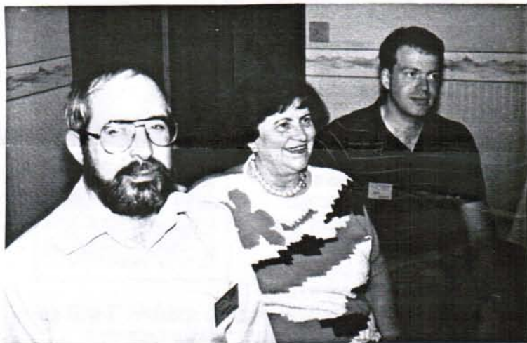
OUTGOING BOARD MEMBERS KJ6LD, KA6ING, N3AHA