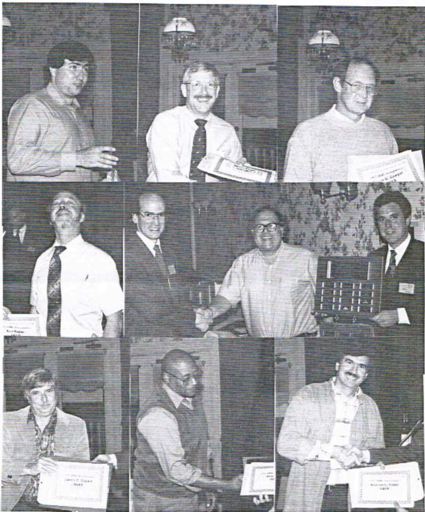
High happenings at the Awards Banquet. Honorees receiving their awards. Across top from left: KI6EZ, W6OAT, AA6KX. Middle from left: N6RO, N6TV, W6QHS, N6IP. Bottom from left: W6XX, N6ZB, AE6Y