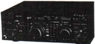
FT-100MP HF Transceiver