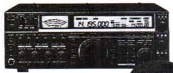
IC-775DSP HF Transceiver IF-DSP!

Get familiar with your new rig before CQP!!