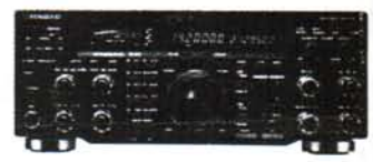
TS-870S HF Transceiver