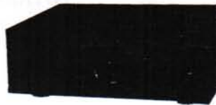
FT-1000MP HF Transceiver