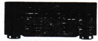
TS-870S HF Transceiver