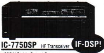
IC-775DSP HF Transceiver IF-DSP!

Get a new rig and be ready for the new "Contest Season"