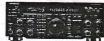
TS-870S HF Transceiver