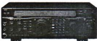
FT-920 HF+6M Transceiver