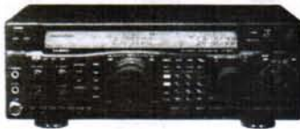
FT-920 HF-6M Transceiver