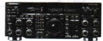
TS-870S HF Transceiver