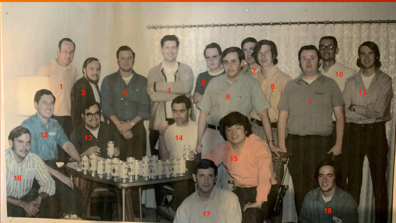
1-K6EBB; 2-WA6DKF (N6RO); 3-W6GFS; 4-W6CUF; 5-DJ6RX/W6; 6-XE1KS; 7-K6SDR (N6CW); 8-WB6ABK (K6ABK); 9-K6CQF; 10-K6ERT; 11-WA6DIL; 12-W6NLG; 13-W6RGG; 14-K6KM; 15-JA3USA; 16-WB6QLZ; 17-K4BVD (W6OAT); 18-WA6BVY